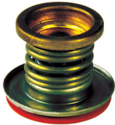
← Pressure Valve (fit rubber seal down)